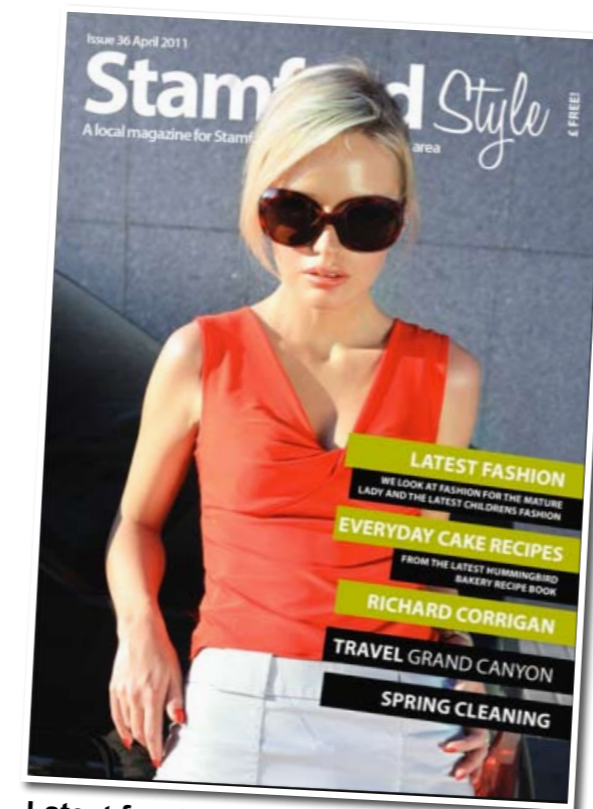
Latest front cover

So, what does the future hold for CT Stamford? Lee is optimistic: 'We are always looking to grow the magazine and help promote local businesses and charities so we look all the time for new content and press releases that we can feature. As for our online strategy we are developing an online business directory and an online voucher website, which will enable people to publish their special offers through the use of vouchers which will also give them a way of tracking which promotions are working best for them'.