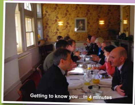
Getting to know you ...in 4 minutes

After an initial chat over coffee, attendees sat down and began a relentless process of 4-minute face-to-face sessions with every other attendees. Proceedings were master minded by the President with stopwatch and whistle!